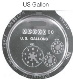
1" and 1 1/2"

Pulsar Wiring. The pulse element is a 4-watt rated reed switch which requires power from an external source. The unit is to be wired in series with no regard to polarity. Note: Maximum voltage, 24 V AC/DC, 0.2 Amp current, not to exceed 4 watts, current limit only max. resistance in series with reed switch.