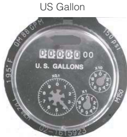
1" and 1 1/2"

Pulsar Wiring. The pulse element is a 4-watt rated reed switch which requires power from an external source. The unit is to be wired in series with no regard to polarity. Note: Maximum voltage, 24 V AC/DC, 0.2 Amp current, not to exceed 4 watts, current limit only max. resistance in series with reed switch.