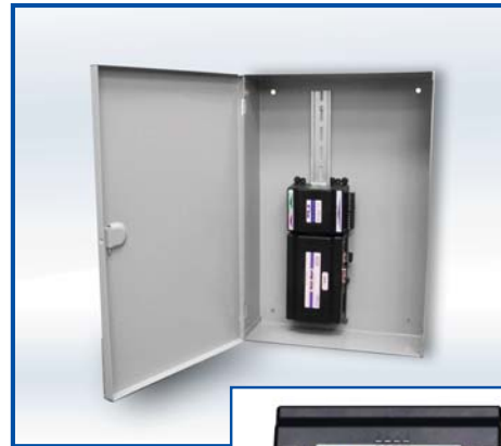
Enclosure Dimensions: 12.25" W x 18.25" H x 4" D