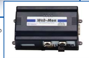
Web-Mon Unit (No Enclosure) Dimensions: 7" W x 5.5" H x 2.5" D